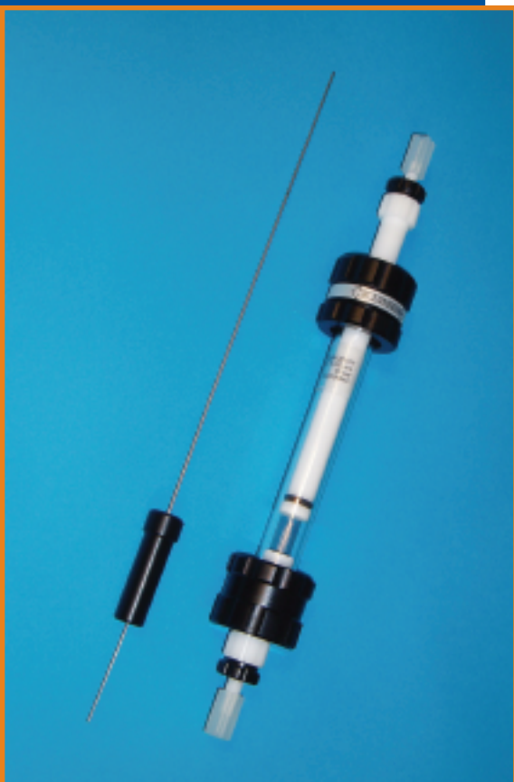
Econoline LP ® Column with frit removal tool.